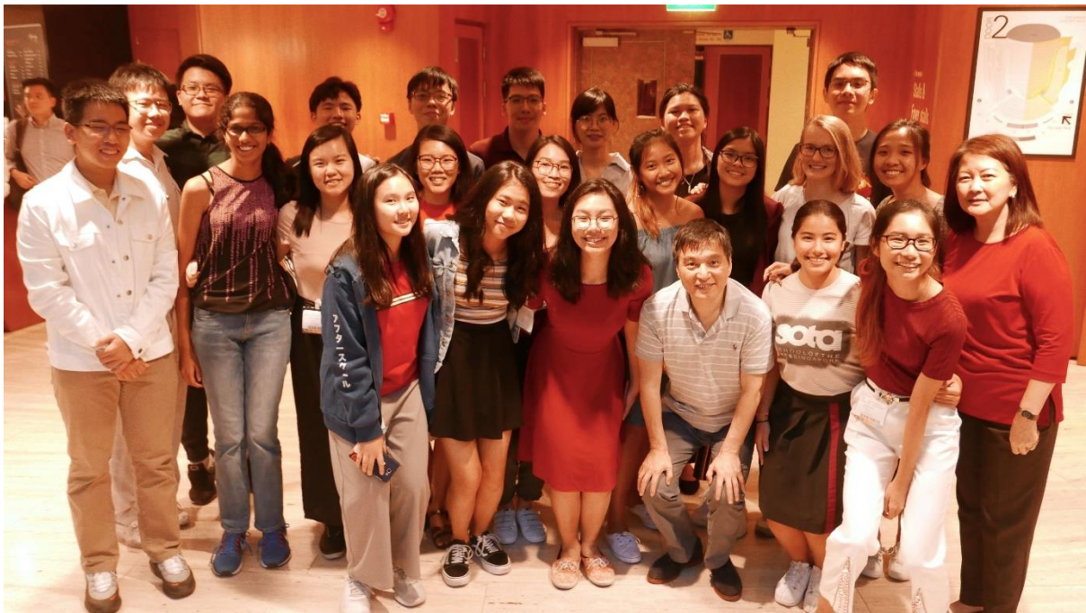
YC members with Maestro Lan Shui, 21 January 2019

Decisions made by the choirmaster and choral management are final.