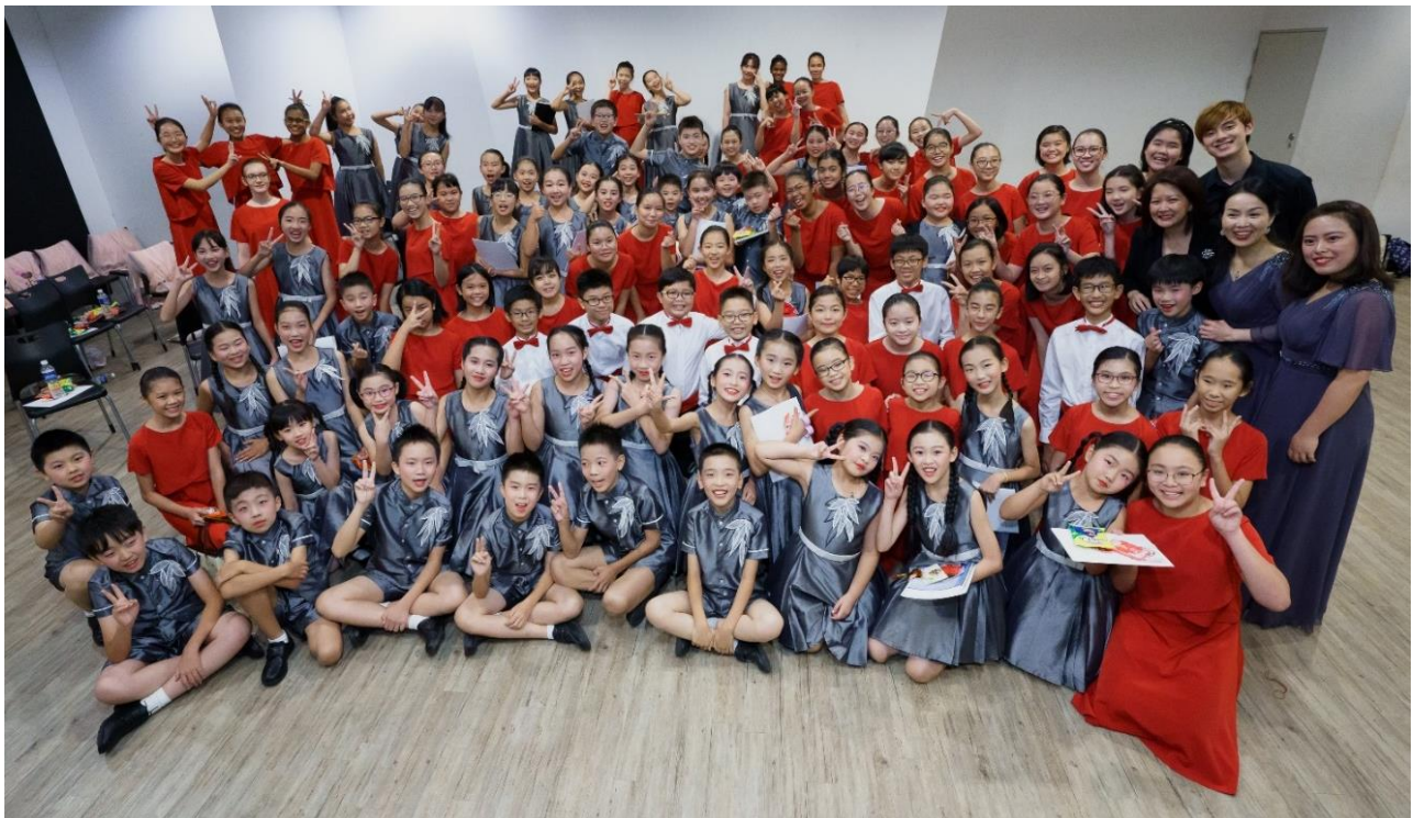
SSCC & Shenzhen Colourful Stones Chorus, Singapore International Choral Festival (SICF), SOTA, 3 Aug '19