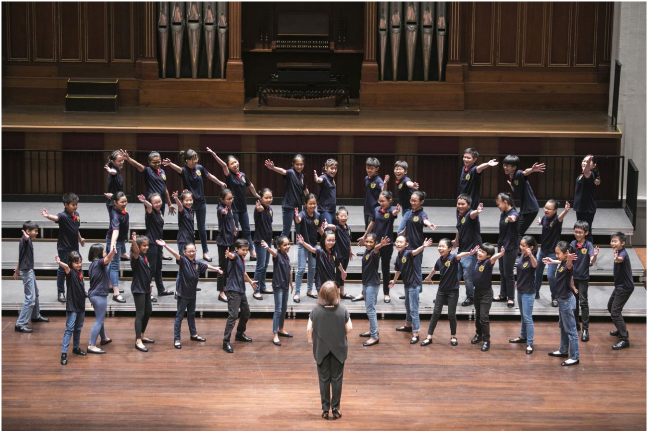
SSCC-TW x SNYS Presentation Concert, Victoria Concert Hall, 18 Nov '19