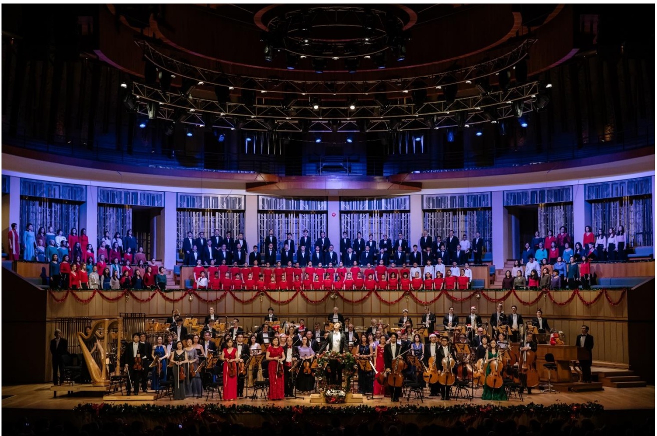
SSO Christmas Concerts, Esplanade Concert Hall, 13-15 Dec '19