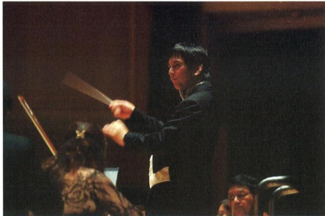
Lan Shui conducts the Singapore Symphony Orchestra